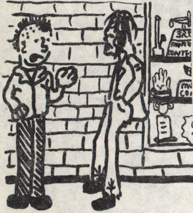
"This haircut has it's advantages. I moonlight as a 'Brillo' pad."